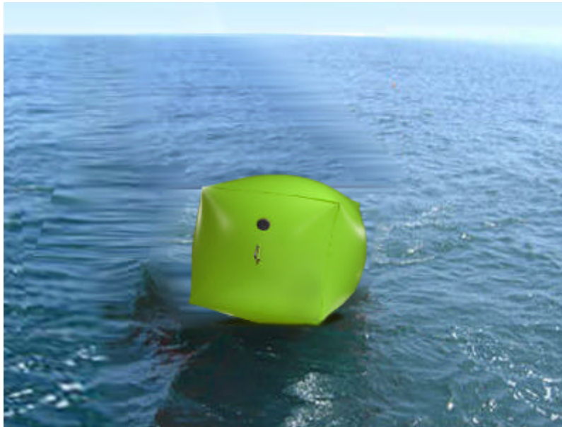
Killer Kiwi™ Naval Gunnery Target balloon

Killer Kiwi™ is a very small adrift target (NavTGT) designed to blow and tumble across the wave surface, primarily for small guns target practice or air-to-surface gunnery practice.